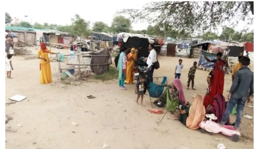
DHARA team conducting survey in Patrakar colony, Manyawas

During the preliminary survey conducted in Patrakar Colony, Manyavas, it was observed that a significant population was living in the basti without access to basic amenities. The residents were primarily migrants from various parts of Rajasthan. A notable concern was the lack of awareness and reluctance among parents regarding vaccinations. Some families were uninformed about vaccinations, while others held misconceptions and myths surrounding vaccines. As a result, a considerable number of children had either not completed their vaccination or hadn't received any vaccines at all.