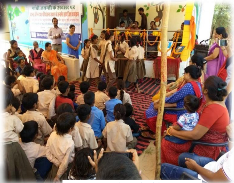
Figure 2 Bal Diwash celebration