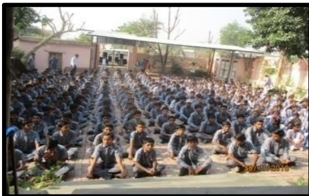
Figure 1. Students participations during Dosti week