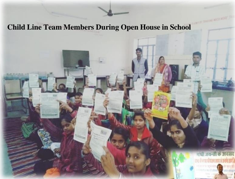
Child Line Team Members During Open House in School

DHARA SANSTHAN ENHANCING SOCIAL DEVELOPMENT