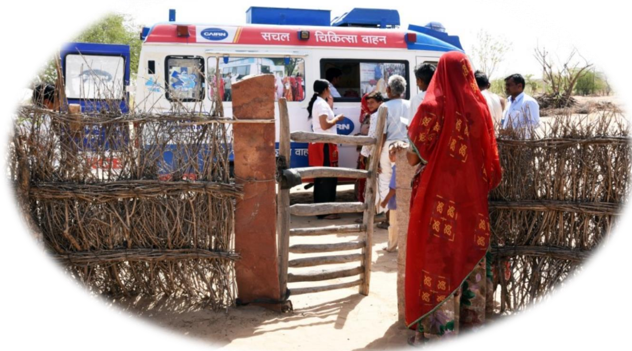
Figure. Awareness camp on Health and Hygiene

Door to Door Service through MHV project